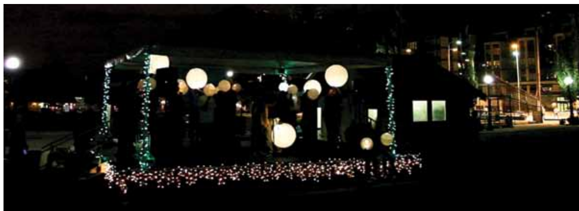
Turn the Light On event stage with light carriers filling the stage with their light globes.

The more of these experiences I have over this long period of time, they begin to create a crack in the wall. Some light starts to come in.